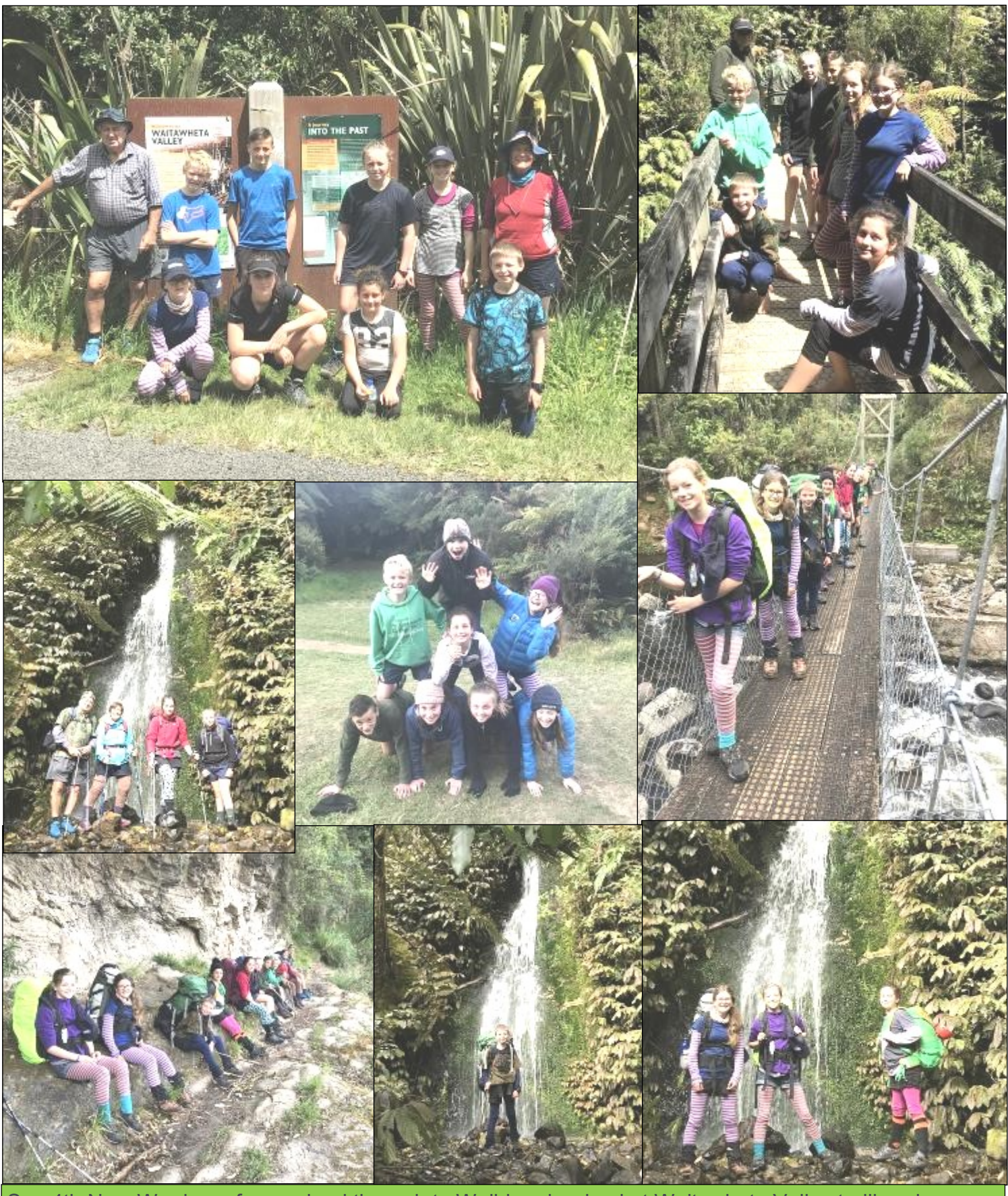
Sun 4th Nov: We drove from school through to Waihi and arrived at Waitawheta Valley trailhead on Franklin Rd at 11am and after eating morning tea and organising our packs we began hiking Daly's Clearing Loop. Before entering the trail we had to clean our boots with brushes and a spray, this was to prevent the spread of the kauri dieback. After nearly 10km of mostly uphill hiking we arrived at Daly's Clearing Hut at 2pm. We set about organising our bunk arrangements for the night. The huts have no power or cooking facilities, so we had carried our propane stoves in our backpacks which we used to cook our dinners and desserts. We played cards, worked on our 'keeping ourselves safe' activities and enjoyed each others company. After a peaceful night in Daly's Clearing Hut, we got up and made our breakfast porridge. Each morning we repack our backpacks to make them as comfortable as possible for the day ahead.